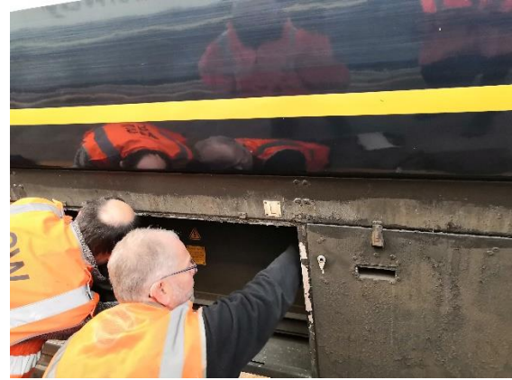
Figure 1 - Identifying measurement positions with SWR

Measuring the conducted emissions entails: measuring the line voltage and AC line current. Alongside these, GPS data is recorded for speed, direction and location to inform the results. To record the line voltage and current, voltage probes and Rogowski coils are attached to cables on the underframe of the train.